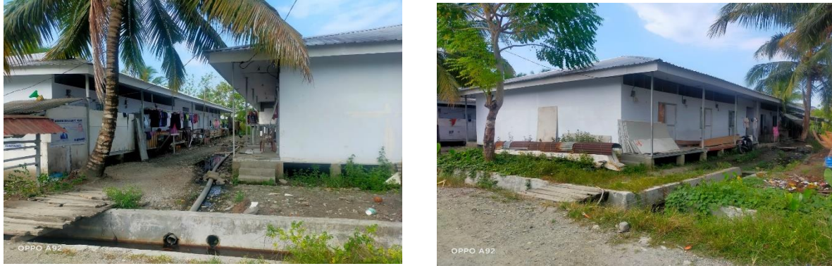
Figure 4: Temporary shelter in Tompe Village

Based on the results of field interviews, it is concluded that disaster management in Tompe Village is not in line with actual expectations. This can be seen in the aspects of granting, medical care, temporary housing, and health facilities after a disaster occurs. This research focuses on the dimensions of granting and temporary housing. The granting of grants itself reaps problems that have an impact on the development process as explained above. While the condition of temporary housing is getting worse, where many residential facilities have been damaged, lost, and have not existed since the first shelter was built. The impact is the condition of the people who experience prolonged suffering.