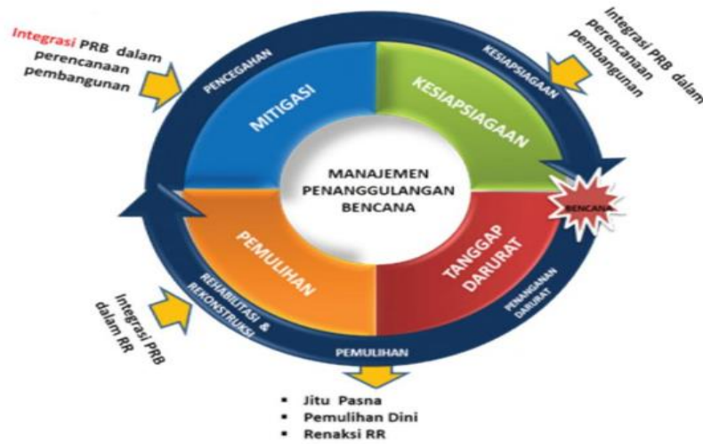
Figure 1: Disaster Management Cycle

The picture above explains the disaster management cycle implemented in Indonesia, including. 1. Mitigation, at this stage is an effort to reduce the impact of the disaster caused, 2. Preparedness in the form of training, graduation and socialization to the community in order to form a disaster resilient community, 3. Emergency Response, a series of activities to reduce suffering and losses from the impact during and or after a disaster, 4. Recovery is an effort to restore normal life for disaster victims when before the disaster occurred (Danil, 2021).