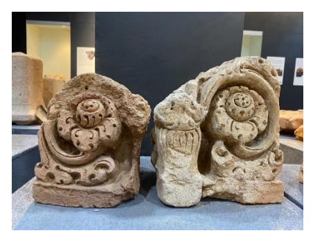
Figure 9: Froral Relief