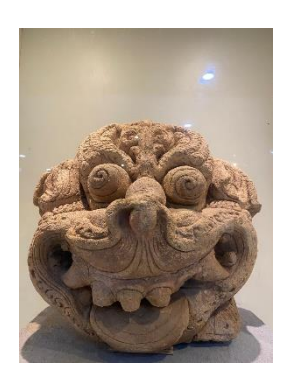
Figure 7: Human Relief

The mixture of culture and belief in the architectural art of the Bumiayu Temple Site shows the value of local wisdom during the Sriwijaya Kingdom. The relief motifs found in the Bumiayu Temple building have their own value, such as human (divine) reliefs depicting humans' closeness to the god or creator, animal reliefs (cows, lions, parrots) showing several sacred animals in Hindu belief, then floral relief motifs (tendrils, lotus flowers) show humans' closeness to nature in order to remain balanced in living life [20].