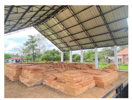
Figure 4: Temple 2