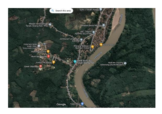
Figure 1: location of the bumiayu temple site

The Bumiayu Temple site is located in Bumiayu Village, Tanah Abang District, Pali Regency, South Sumatra. Bumiayu Temple is on the edge of the Lematang River and is at the intersection of the mouth of the Siku River and is surrounded by tributaries of the Lematang River [12]. The Bumiayu Temple site was first published in the report Hindu Monuments in the upperlands of Palembang in 1864 by E.P. Tombrink who visited Lematang Ulu. During the visit, 26 Hindu relics were found in the form of transit statues, one of which was the Nandi statue. Then a controller named A.J. Knaap discovered the ruins of a 1.75-meter-high brick building which was the former Gedebong-Udang palace [13].