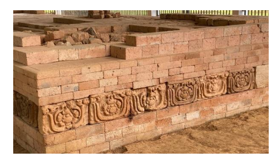
Figure 6: Temple 8

Vol. 6, Issue.6, Nov-Dec 2023, p no. 210-222