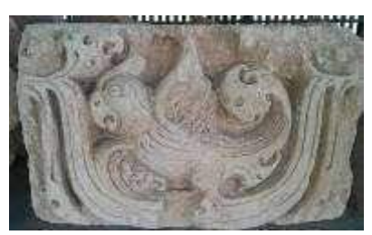
Figure 8: Parrot Bird Relief

Vol. 6, Issue.6, Nov-Dec 2023, p no. 210-222