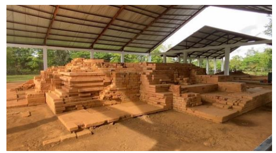
Figure 5: Temple 3