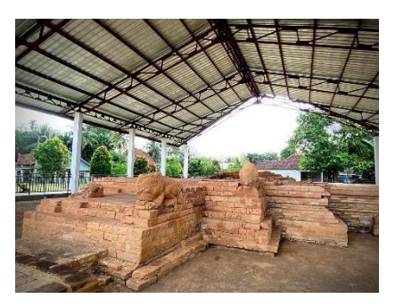
Figure 3: Temple 1

Vol. 6, Issue.6, Nov-Dec 2023, p no. 210-222