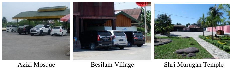
Figure 4 Parking Facilities

"The availability of parking space at the Azizi Mosque is still not wide enough. During Friday prayers, the Azizi Mosque is full of visitors, so the congregation uses the road as a parking lot." (Key Respondent: Local Figure).