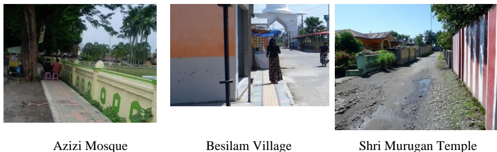
Figure 3: Pedestrian Path

The community considers the ease of access to the entrance to the study area to be quite good; Azizi Mosque (3.6), Besilam Village (3.9), and Shri Murugan Temple (3.1) (Table 2). Visitors will be interested in visiting an area if the access is easy to achieve [20]. So it can conclude that the ease of access can increase the desire of people to come. Unfortunately, the results from field observations showed that the quality of pedestrian access paths was still lacking, especially in Besilam Village and Shri Murugan Temple. For the convenience of the pedestrian path, the respondents gave a meager rating; Azizi Mosque (3.4), Besilam Village (2.7), and Shri Murugan Temple (2.1). This low rating is because the pavement at the destination is damaged, making visitors uncomfortable and unsafe when walking. Traders also use pedestrian paths to sell (Figure 3).