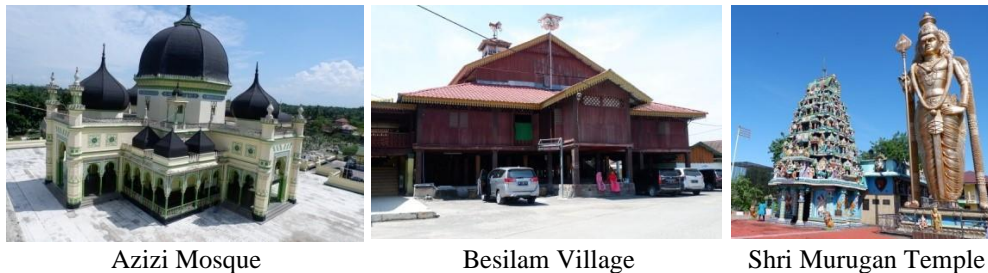
Figure 2: Visual of Religious Tourism

were imported from Murano, Italy, and are stained glasses with ornamental plants. Besilam Village has black-wood material for its walls. And Shri Murugan Temple used the same material as used in The Murugan Statue in Batu Caves, Malaysia: steel, concrete and gold liquid.