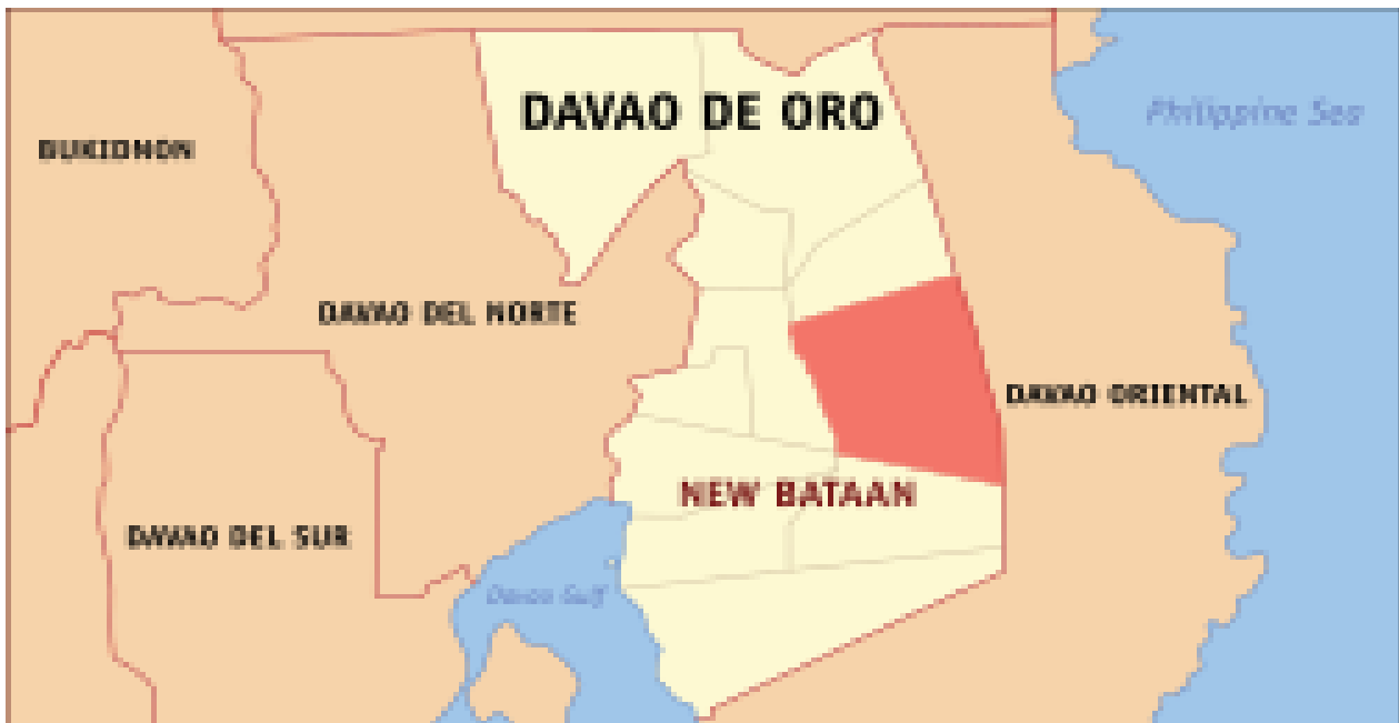
Figure 2. Map of the Philippines highlighting New Bataan in Davao de Oro

In the Philippines' Davao de Oro province, New Bataan is a first-class municipality. It has a population of 47,726 people. Compostela is 16 kilometers (9.9 miles) away, Nabunturan, the provincial capital, is 40 kilometers (25 miles) away, and Tagum City is 75 kilometers (47 miles) away. Republic Act No.