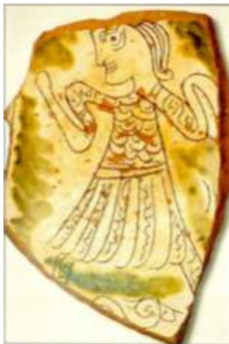
Image 7: Depiction of a female dancer at the bottom of a clay plate (end of 13 th century-14 th century)

In addition, apart from the religious depictions, there are also formal imperial objects or even everyday objects depicting such individual dances. Such a formal object is the crown of Constantine IX Monomachos, which "...consists of seven arched plates [...] On the next plates, smaller in size, two dancers are depicted on either side of the two women..." (Voutsas, p.45). An example of an everyday object is "...the dancing figure depicted at the bottom of a clay plate [...] which dates back to the end of the 13th century and the beginning of the 14th. It is probably about a woman looking right..." (Image 7). (Voutsas, p.46)