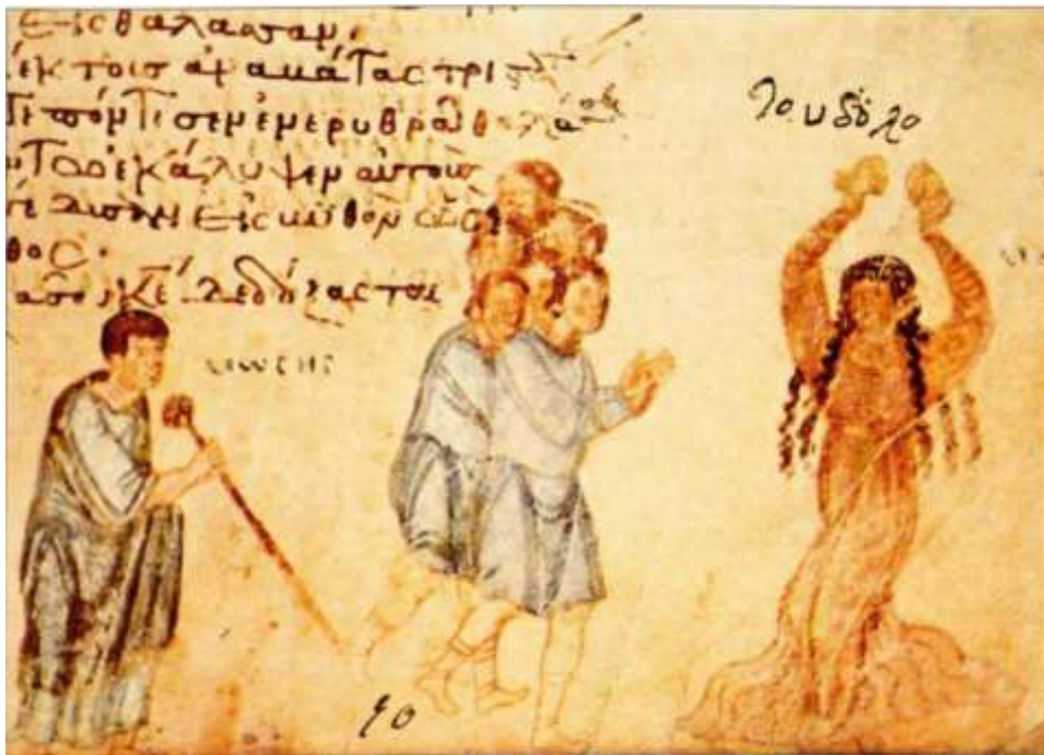
Image 2: Mariam's dance (9th century, Mount Athos)