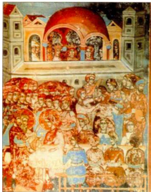
Image 5: A female dance with a man holding each other in a circle

In addition, Parcharidou-Anagnostou (2004) (Image 5), writes that the dance performed in Arbore (1503/4) Romania about the Life of Saint George is even more realistic. During the dance, the dancers – three women and one man – are held by the shoulders and move in a circle, to the sound of the string instrument, the tambourine and the drum and, possibly, based on the chant gesture and the half-open lips of the figures, of the group song sung by the group of women on the right. (p.52)