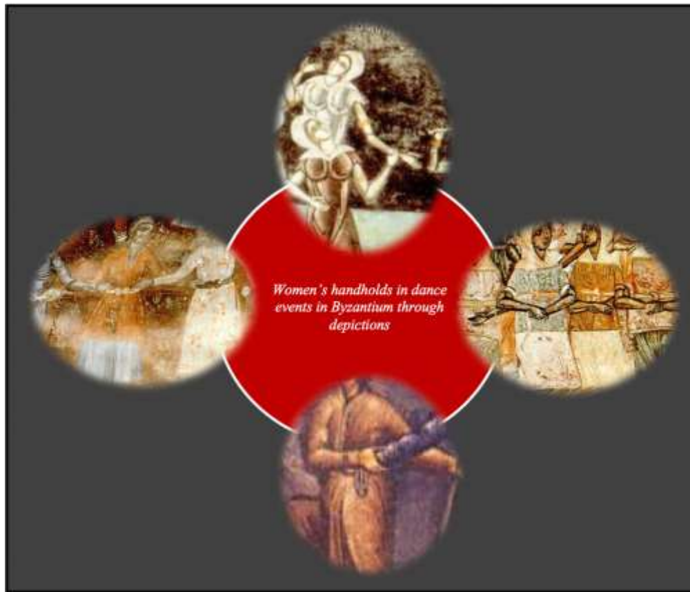
Image 3: Women's handholds in dance events in Byzantium through depictions

Apart from the purely female dances though, there are depictions which show women dancing together with men in mixed dances. As mentioned by Voutsas (2004) (Image 4) "...mixed dances add to purely female dances. A dance as such is found in the katholikon of the Holy Monastery of Saint Gregory in Mount Athos [...]. Three men lead the chain dance and three women wearing traditional costumes follow..." (p. 48).