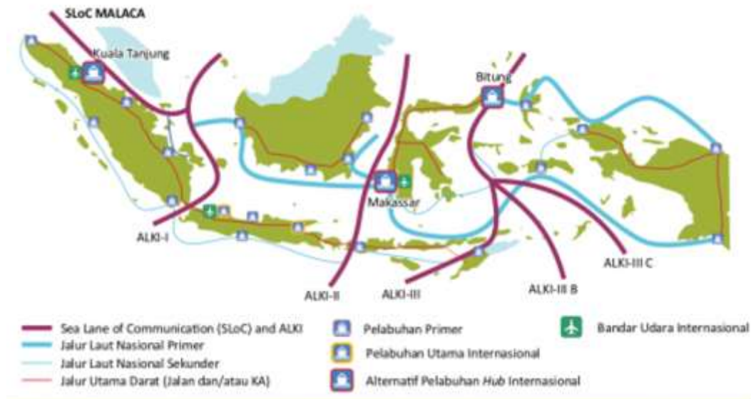
Figure 1. ALKI Shipping Routes