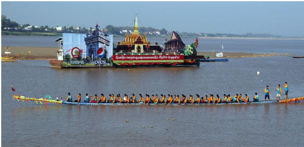
Figure 4 Long-boat racing on the Mekong River

Art and Culture news there is 11 news being 17 percent of all news about Thailand. Art topic related the entertainment sectors particularly television and magazine of Thailand are popular in Laos. Globalization era and digital technology do provide Laos accessing Thailand entertainment media easier and quickly on mobile. Thailand entertainment therefore plays an important role into Laos. The entertainment news was mostly reported the co-project among both countries such a next example news.